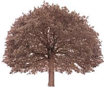
Tree Negative Virgin Paper

Limited reforestation in today's global paper marketplace without PrintReleaf.