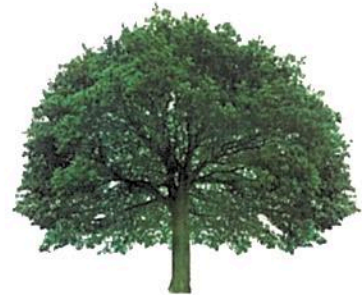
Tree Neutral Sustainably Certified