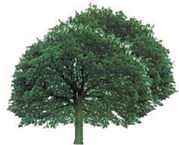
Tree Positive Sustainably Certified